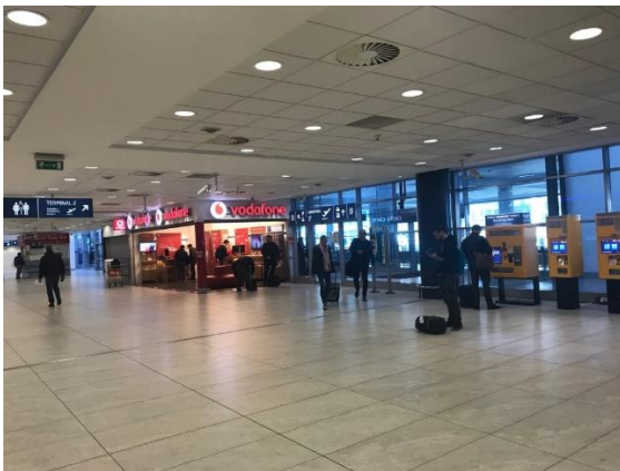
Fig. 1 – Arrival hall at Terminal 2, Prague Airport.

Here you can print their voucher for a better rate and use of the VIP counter: www.exchange.cz/kupon