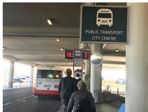
Fig. 4 – Do not go beyond the red LED information sign for your 11 bus.

In order to get to Masarykova kolej ( www.masarykovakolej.cz ) where you are accommodated, it is best to take a bus from the airport and then 3 more stops on the tramway. You need to pay attention to which bus you are taking as it is a bit confusing at times. You need to take the 119 bus, but there are two kinds of 119s: one that only delivers travelers to the airport (at the more distant end of the platform) and one that picks up passengers to go to the city. Please do not run to the more distant bus 119 you will see. Your bus will stop at about the middle of the platform, just before the information sign with red LED characters (fig. 4) which shows your bus departure time.