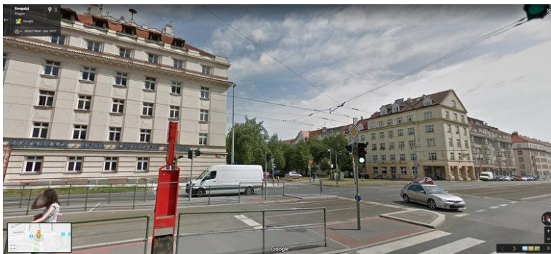
Fig. 5 – Arriving to Thákurova tramway stop (line 20 and 26).

Once you have gotten out at Thákurova, get across the tramway tracks and head to the park-like area. That is the Thákurova street (Fig. 5). You will be walking for two minutes on the left side of the park (Fig. 6).