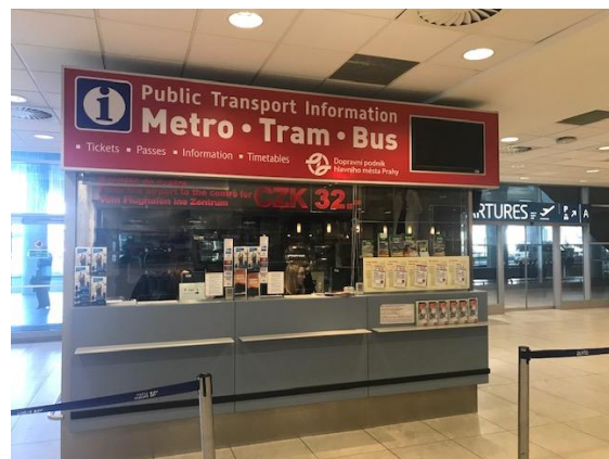
Fig. 2 – Transit Authority booth.

Fig. 1 shows the yellow ticket machines for public transit near the glass wall. You can use contactless bank cards there, as well as outside the terminal on the platform waiting for your bus. Alternatively, you can purchase your tickets at the Public Transport Authority booth beyond the Vodafone shop (fig. 2). It is a good idea to buy more tickets as you may need them later. 24 CZK ticket is good for a 30-minute ride, which will most likely cover majority of your needs. For the ride from the airport, though, you need the 90-minute ticket.