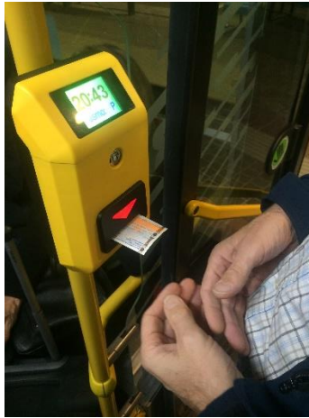
Fig. 3 – Validating your ticket on board of a bus.

That way your ticket gets the time stamp and you are good to go for 30/90 minutes anywhere in the system. You only stamp once. A ticket without the time stamp at the proper space is invalid.